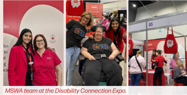
MSWA team at the Disability Connection Expo.

Our dedicated ESS team looks forward to continuing our mission of empowering people with neurological conditions to achieve their employment goals, while partnering with local employers to foster inclusive, diverse and resilient workplaces across WA communities.