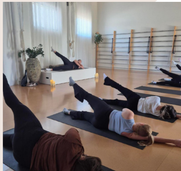
A light Pilates session.