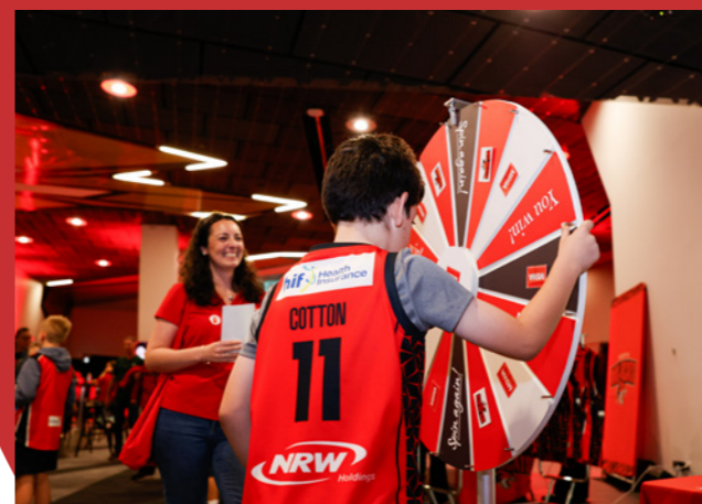
The public spinning the wheel to win a prize.