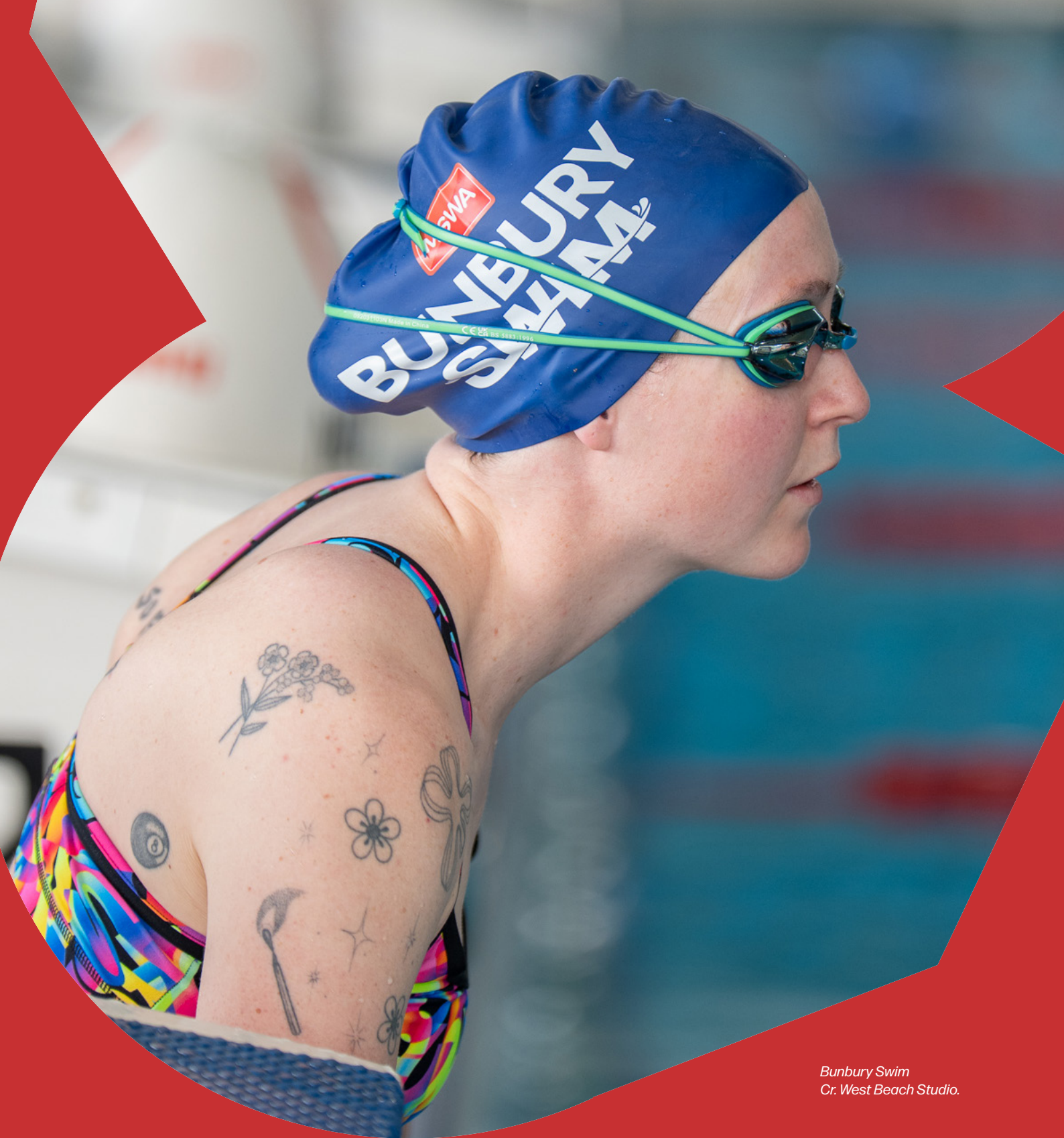
Bunbury Swim Cr. West Beach Studio.

To find out more about our services, create connections or show support for our cause, visit mswa.org.au