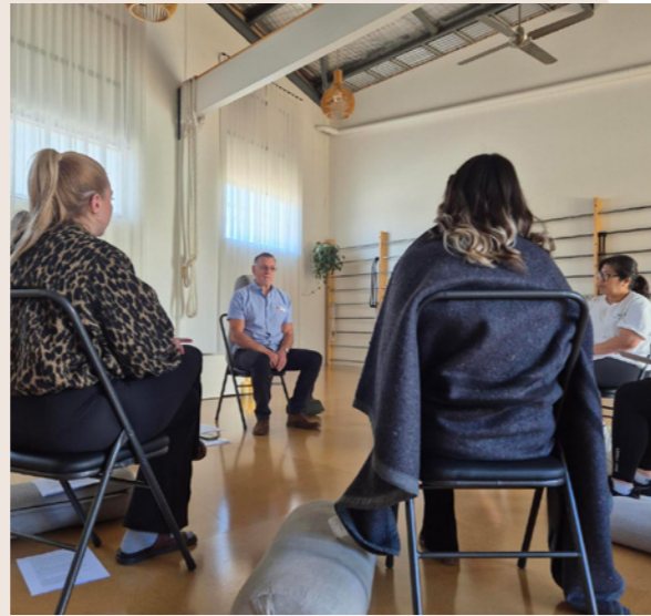
Connecting with others on the same path.

To learn more or explore other events, groups and sessions created especially for carers, head to mswa.org.au/get-involved/events