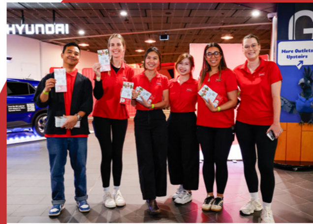
MSWA team at the Open Air Game.