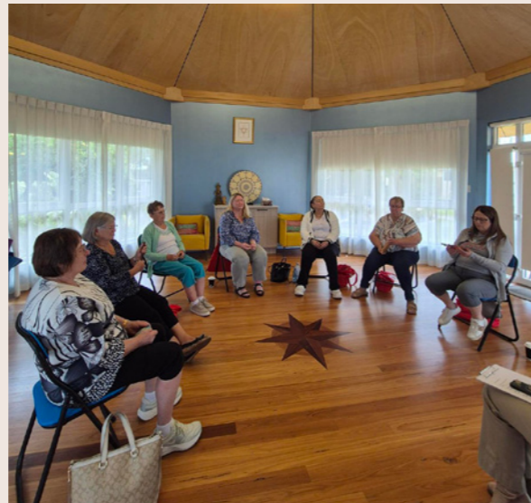
A moment to reflect.